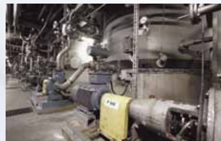
A typical tank storage area with transfer pumps

Preventing problems with mechanical seals that are used on pumps and reactors to handle polymer dispersions (latex) is a major engineering challenge. Essentially, the problem is that polymer dispersions are not thermodynamically stable, and they tend to coagulate. Polymer particles form compact agglomerations which can quickly bring the process to a halt. EagleBurgmann has developed a sealing strategy specifically for this difficult application, which provides a cost-effective, long-term solution.