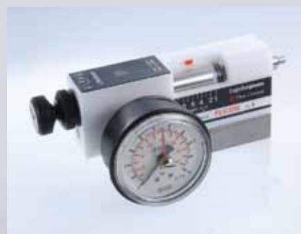
FLC flow controller