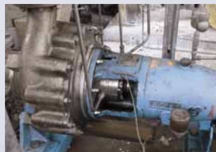
This type of pump with special EagleBurgmann cartridge seal is used at various stages in the process.